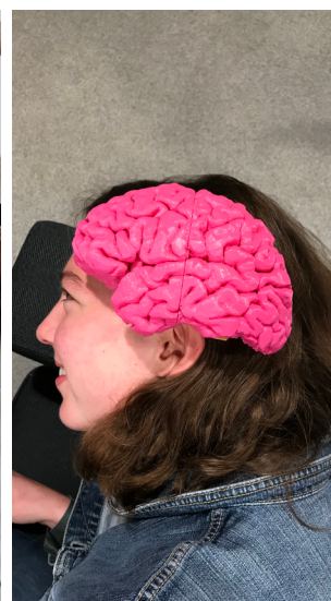
Public engagement competitions