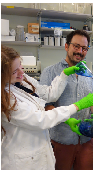
1 or 2 week in-person placement