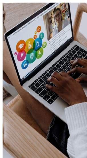
Online skills, employability and careers workshops